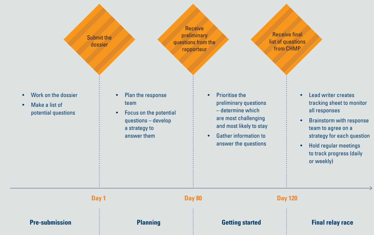
Figure 1: Techniques that streamline the process of responding to authority questions

To adequately plan for and streamline activities associated with preparing responses, the regional variability in how questions are posed to the applicant need to be considered. For a European centralised procedure, the review process follows a strictly defined timeline (1). Review begins on day one (clock start), and the initial assessment report from the rapporteur is sent to the Committee for Medicinal Products for Human Use (CHMP) and to the sponsor on day 80. The assessment report includes a preliminary list of questions and provides the first insight to the reviewers concerns