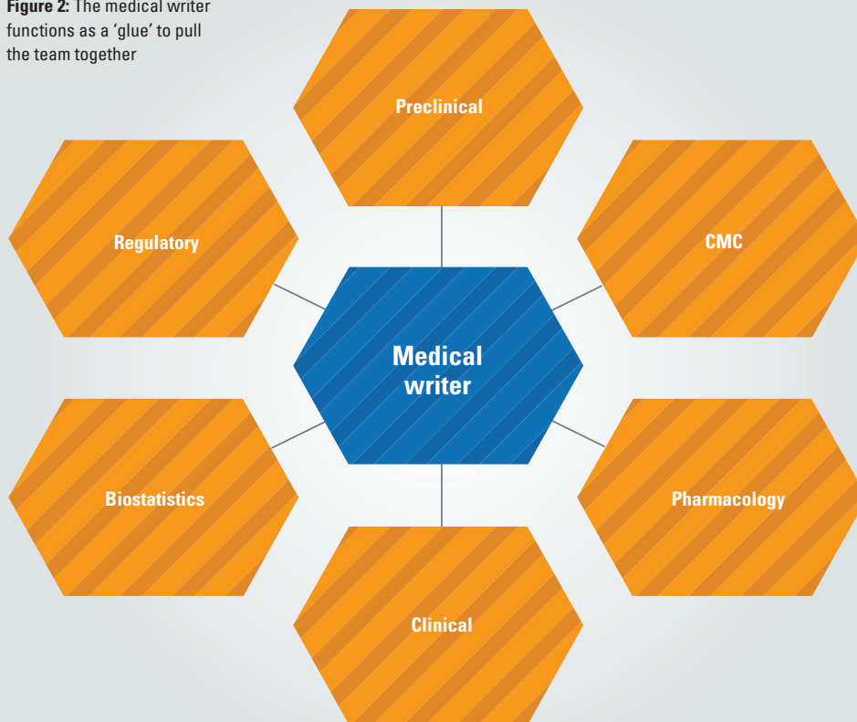
Figure 2: The medical writer functions as a 'glue' to pull the team together

team from a given area – for example, all of the contributors from the clinical team. While walking through each of the questions, the lead medical writer will make a bulleted list outlining what the team thinks are the key messages or tactics to answer each question. The team needs to identify if new analyses will need to be performed to adequately answer the question (which should be captured in the tracking sheet). Make sure that in addition to the writer, there are one or two people assigned to each question to provide the content expertise from the corresponding functional areas (such as statistics or pharmacovigilance). If possible, adopt a divide